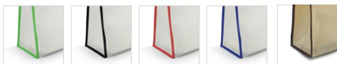
NW-1V White & Green NW-2V White & Black NW-3V White & Red NW-4V White & Blue NW-5V Beige & Brown